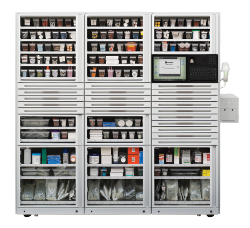
Three-Cell Cabinet Height: 77.5" Width: 76.5" Depth: 27.0"