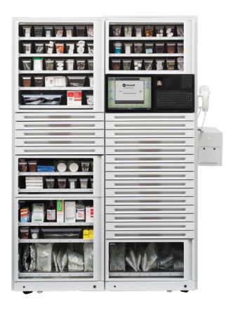
Two-Cell Cabinet Height: 77.5" Width: 51.5" Depth: 27.0"